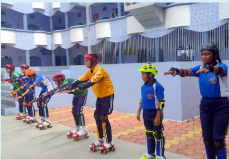
Skating - 2023