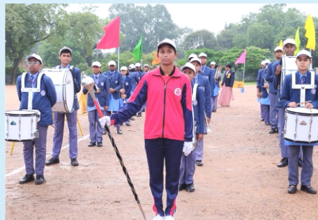
Band - 2023