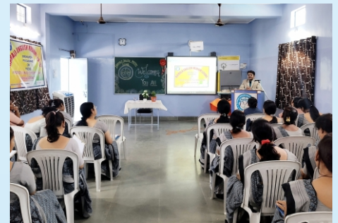
POCSO Seminar - 2023