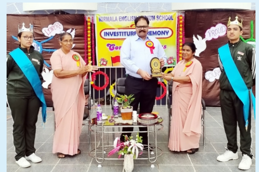
Investiture Ceremony - 2023