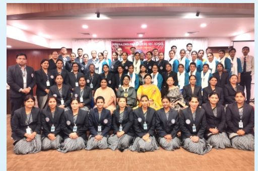
Life Skills Training - 2023